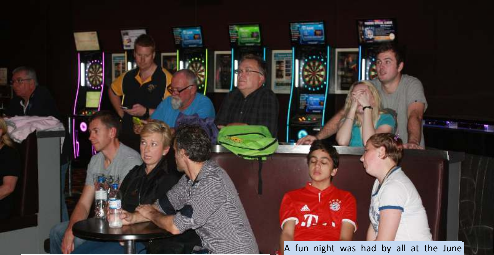
A fun night was had by all at the June meeting at 10 Pin City at Lidcombe. A few people went missing in action before the night started due to work commitments and horrible weather but the rest of us enjoyed pizzas before the competition started.